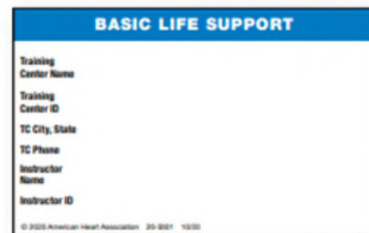
AHA eCards (certificate and wallet size)